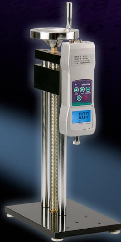
Optional Dillon Model GL digital force gauge.