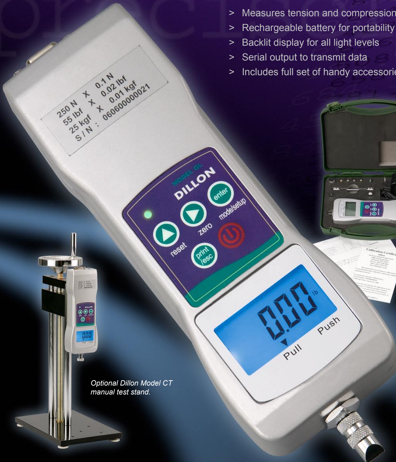
Optional Dillon Model CT manual test stand.